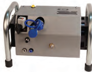
Pressure Intensifier PNP90 SNW XT 2 #CHR2410H