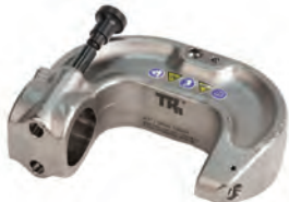
Rivet Clamp NB 45 #CHR2412H