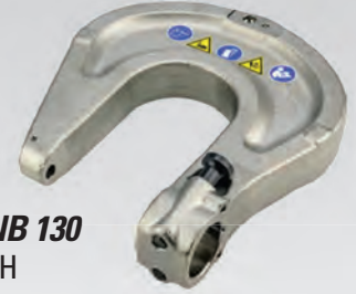
Rivet Clamp NB 130 #CHR2430H