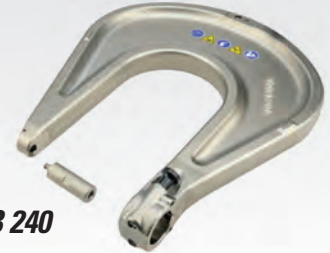
Rivet Clamp NB 240 #CHR2431H