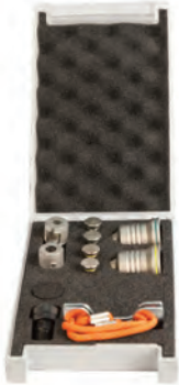
Kit 1 - Punching Ø6mm + Ø8mm #CHR2415H