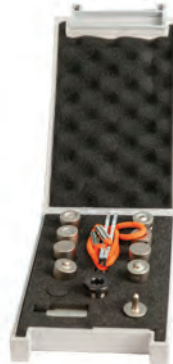
Kit 2 - Flow form rivets Forming, SPR-Extraction Ø6mm + Ø8mm #CHR2416H