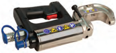
Hydraulic Gun DN4-XT 2 #CHR2411H