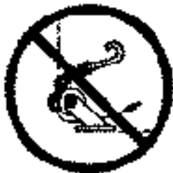
WRONG (Roller is positioned away from tower.)