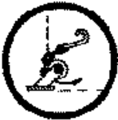
RIGHT (Roller is positioned toward tower.)